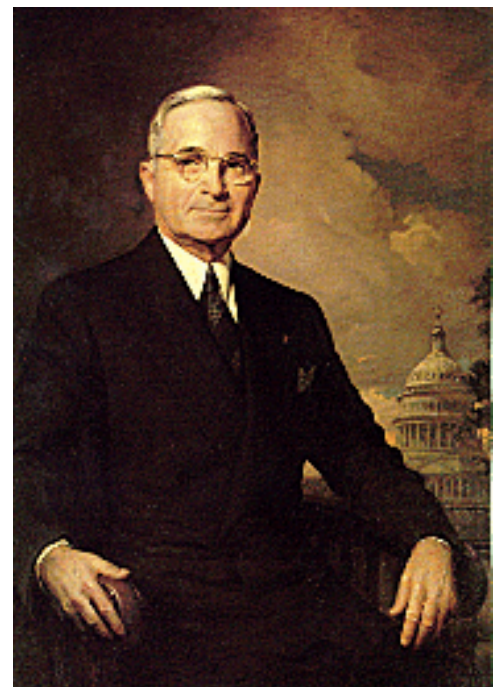
Harry S. Truman , 33rd President of the United States of America

Raised March 18, 1909, the only U.S. President to be a Mason for 50 Years.